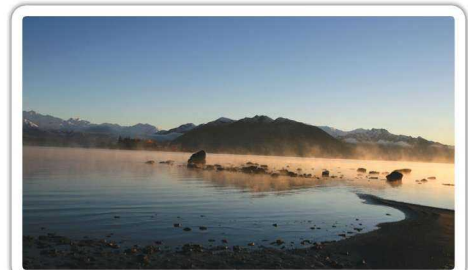
Waterfall Creek - 5 minutes drive