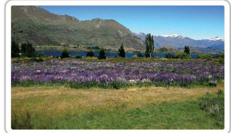
Lupins - Beacon Point Road