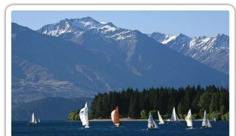
Lakefront - Roys Bay