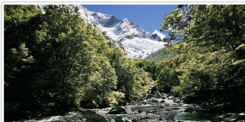
The hike to Rob Roy Glacier