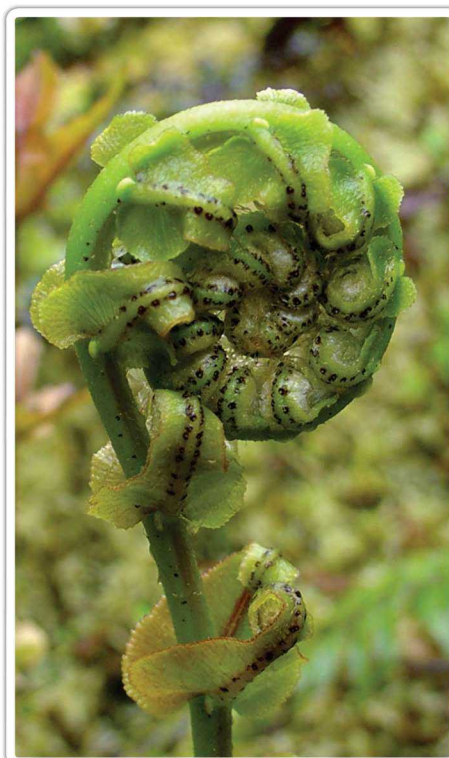
Fern - Rob Roy Glacier