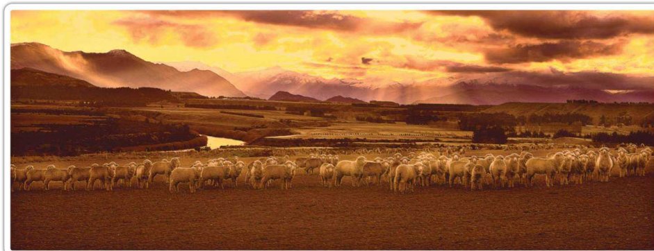
Approaching Wanaka from Tarras

Please check at office for road/weather conditions. The walk is in the mountains and can be subject to very rapid weather changes. Probably the most spectacular day walk in NZ. When driving to the end of the road, every corner provides uninterrupted views of the approaching mountains. Park at the Raspberry Creek carpark. From the carpark the track is extremely well marked. About 1 kilometre from the carpark, cross over a swing bridge and turn left. The first section of the track is a little steeper but then gently undulates through beech and native forests. The views of waterfalls, mountainous gorges and then the Rob Roy glacier itself are breathtaking. In the summer months you may well view gigantic avalanches as sections of the glacier break away.