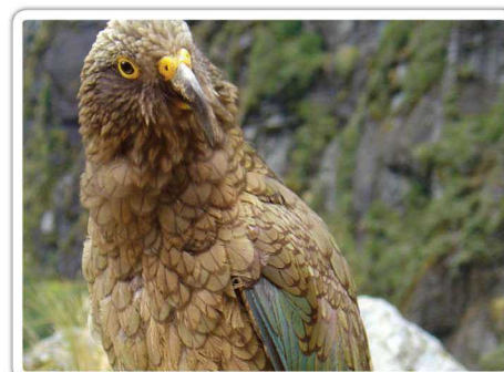
New Zealand's Mountain Parrot - Kea